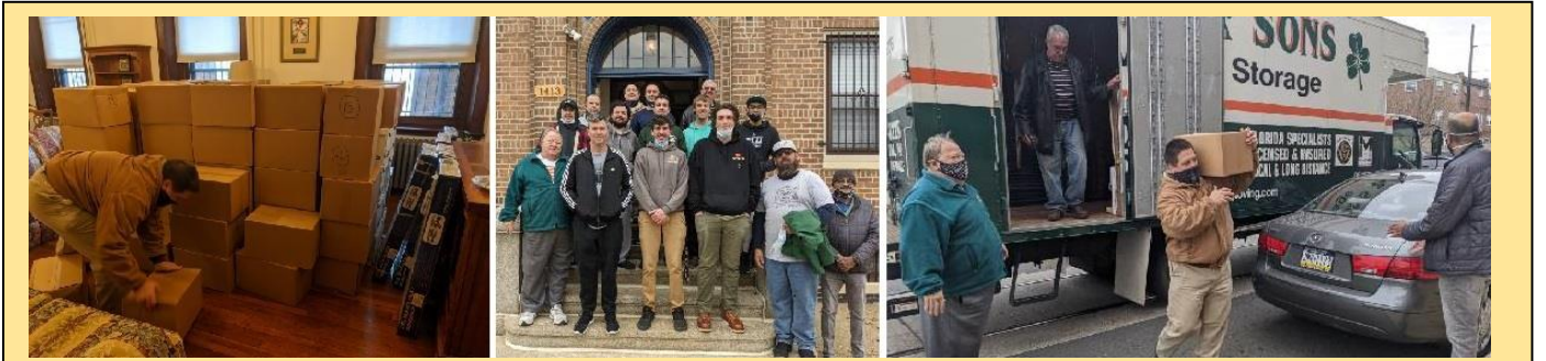
On November 15, our Brother Knights and Boy Scouts helped deliver books to the Sisters of Life.